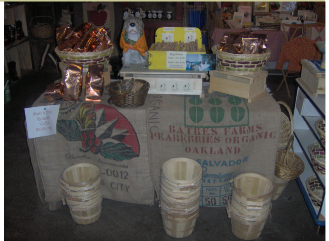
The dog biscuit display at Lakeside Orchards in Manchester.