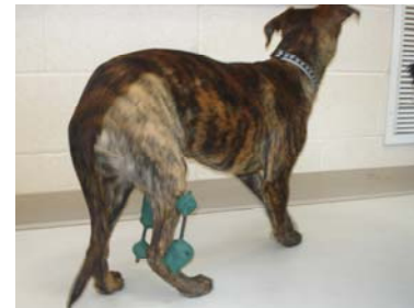
Before and after pictures of Freeway. Happy to be rid of his hardware!