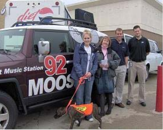
KVHS, 92 Moose and Pepsico representatives pose with 5-month old Pit Bull Terrier Abby.