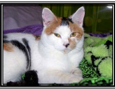
"Yippee! I've been adopted!"

Groups and businesses are also eligible to become Patrons. Even a small group or business with just twenty-five employees could become a Patron for just $1 per person per month! It's a great community service project. For more information, contact Linda Wohl at 626-3491, ext 110 or visit our web site at www.pethavenlane.org.