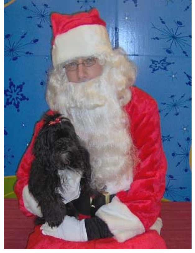
(Sophie, a 5 month old Shiztu-poodle mix gets her photo taken with Santa during the PetSmart Santa photo weekend.)

The severe winter weather caused some problems for KVHS. Exceptional snowpack created serious ice buildup resulting in several leaks in many areas of the building. But fear not! The daring crew from G&E Roofing scaled our multi-pitched roof, removing the heavy snow and ice. Fortunately, no permanent damage appears to have occurred.