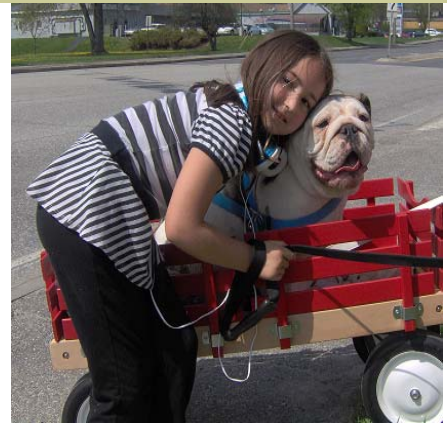
One of our many supporters who participated in the walk with her furry friend.

Thank you to all who helped make this years Mutt Strut a success!